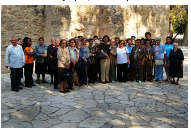
Christmas Bazaar, its traditional fund raising tea party as well as other fund raising efforts.

delegation the Branch was part of the CRCS trip to Sri Lanka. In addition the Branch organized an excursion for some elderly people of Kyrenia, its own